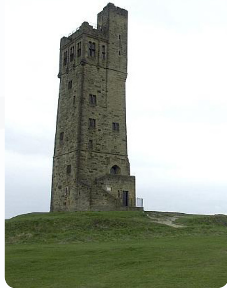
Victoria Tower, Castle Hill

Kirklees Council has been using Civica's Fraud Detection solution for over three years. They are now live with Fraud Financial Investigations Instance, and may be looking at moving to a Corporate Investigation approach in the near future. Civica's flexible and robust corporate anti-fraud Instance allows authorities to take a proactive and diverse approach to fraud management and investigate all aspects of frauds that are perpetrated against a local authority and any other authority that deals with fraud investigations such as Health, Police, and Building Societies etc.