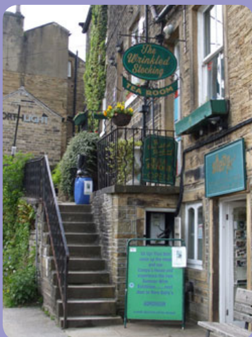
Nora Batty's steps from the TV series: Last of the Summer Wine